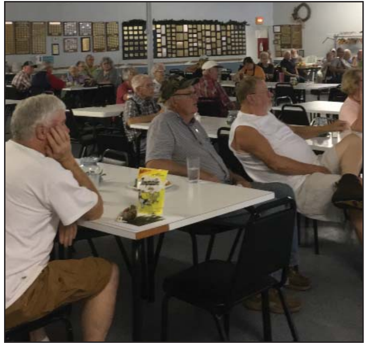
Seniors watching "Big Pharma" in California, MO